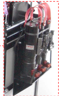
Carrying Device for ITH Bolt Tensioning Cylinders (optional)