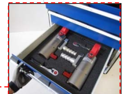
Drawers with individual foam inlays