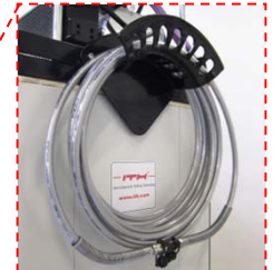
Carrying device for ITH hydraulic hoses (backside)