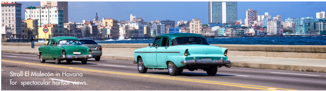
Stroll El Malecón in Havana for spectacular harbor views.