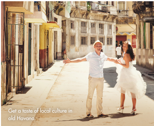
Get a taste of local culture in old Havana.