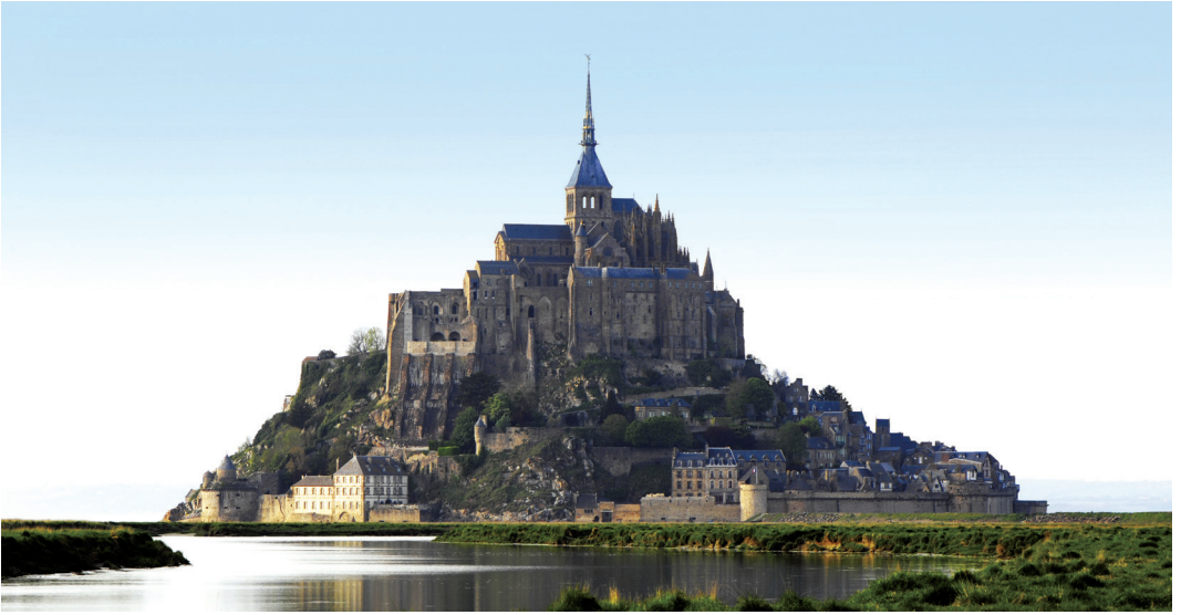
Mont Saint-Michel, France