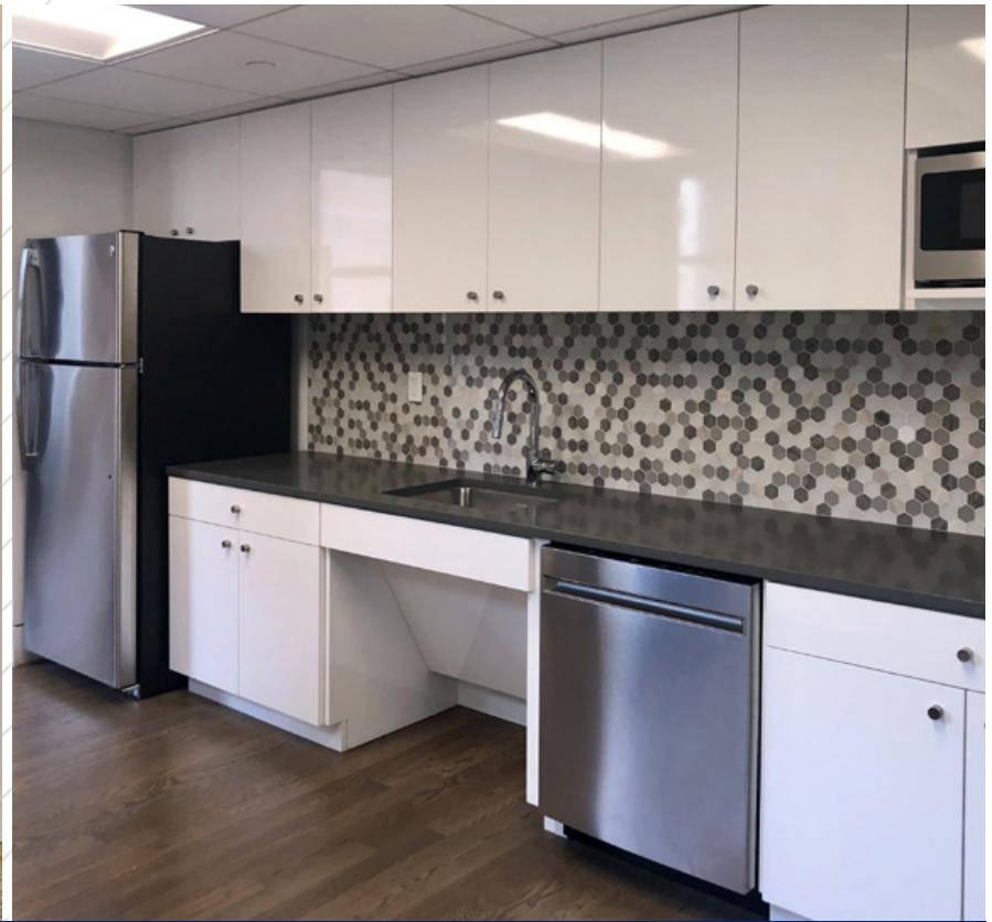
Sample Office Fronts and Pantry