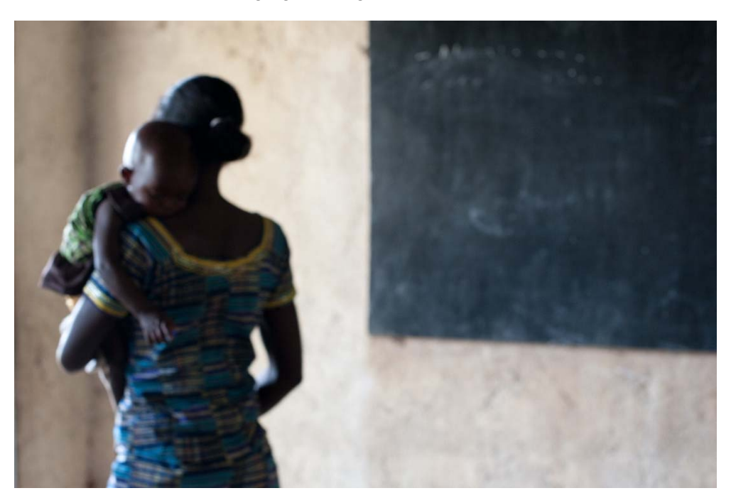
Young Vumilia, Namuziba, DRC, December 2014.

In a study of 141 countries, more women than men were killed during disasters, particularly in poor communities and at an earlier age.<sup>75</sup>