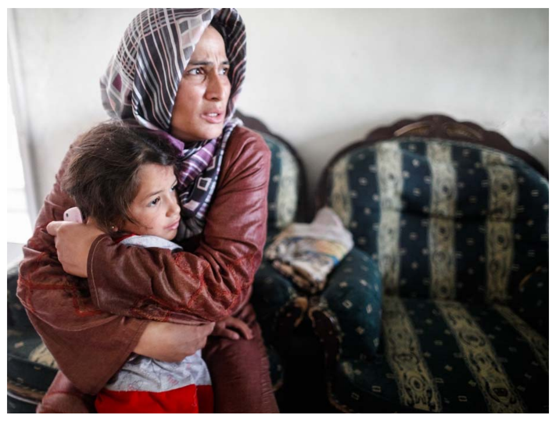
A woman and her child take shelter as a jet bombs the streets around her home in, Aleppo, Syria in 2012.