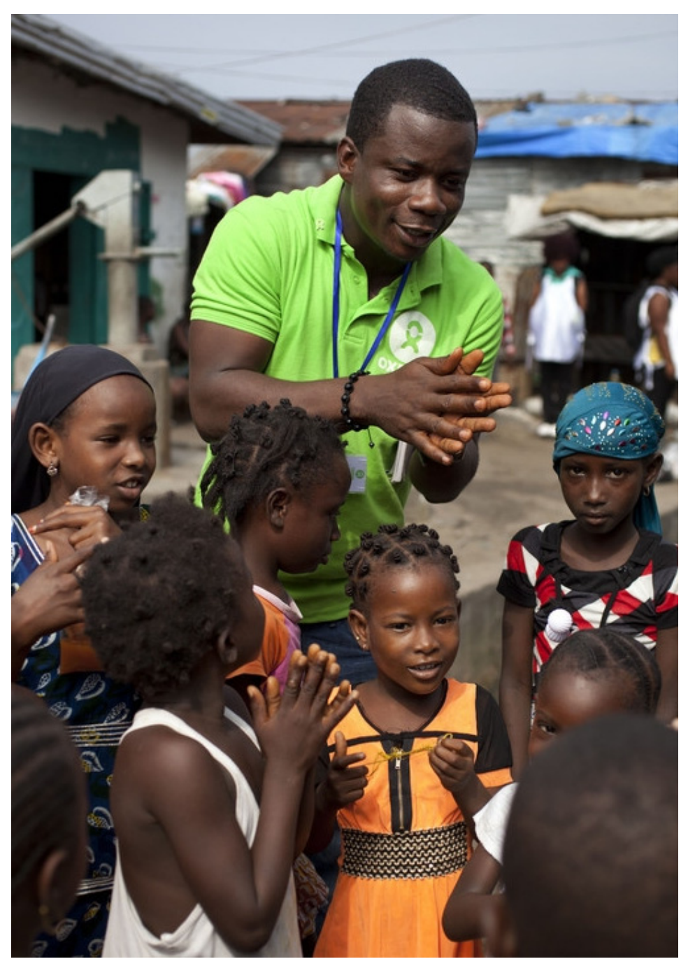
Oxfam Community Support Workers teach children in West Point, Monrovia how important it is to wash their hands to help prevent contracting Ebola, West Point, Monrovia, Liberia, 2014.