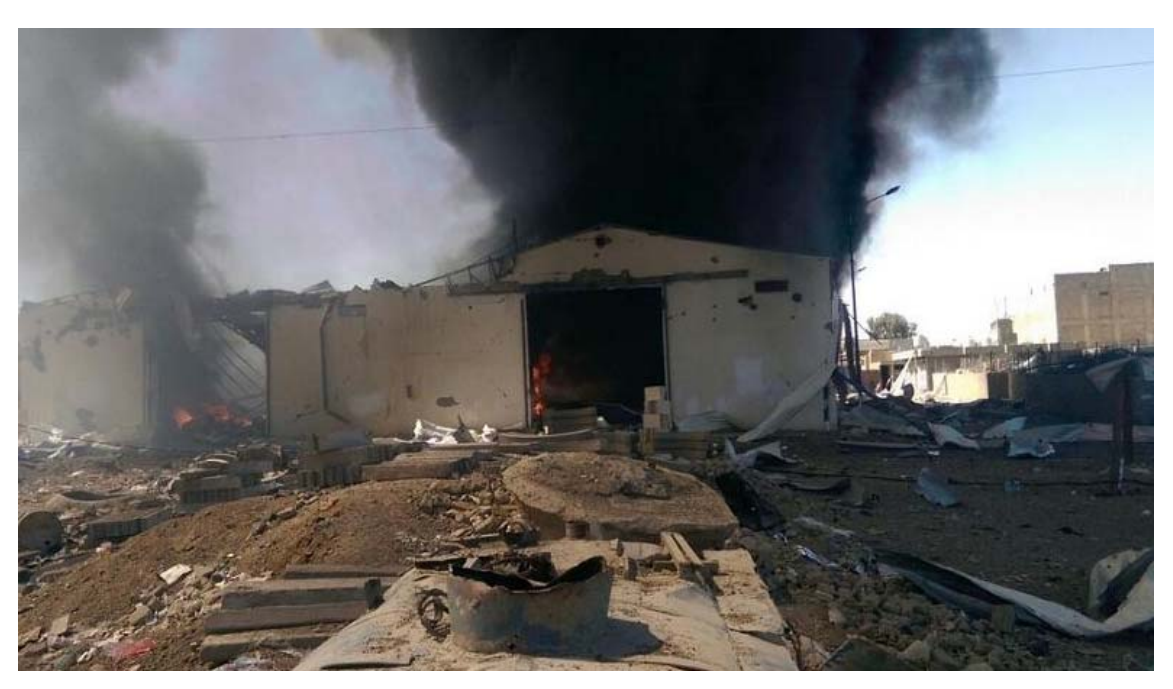
Oxfam's warehouse in Saada, Yemen after an airstrike in April 2015.

The humanitarian community must complete the reforms it has promised to undertake for years – on early action, accountability, partnership and building resilience. It must challenge the world to tackle the drivers of humanitarian crises, and rekindle outrage at the atrocities and obstacles to access to aid. For if humanitarians do not seek to do this, who will?