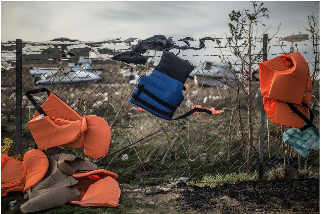
Lifejackets at a landfill site on Lesbos Island in Greece.