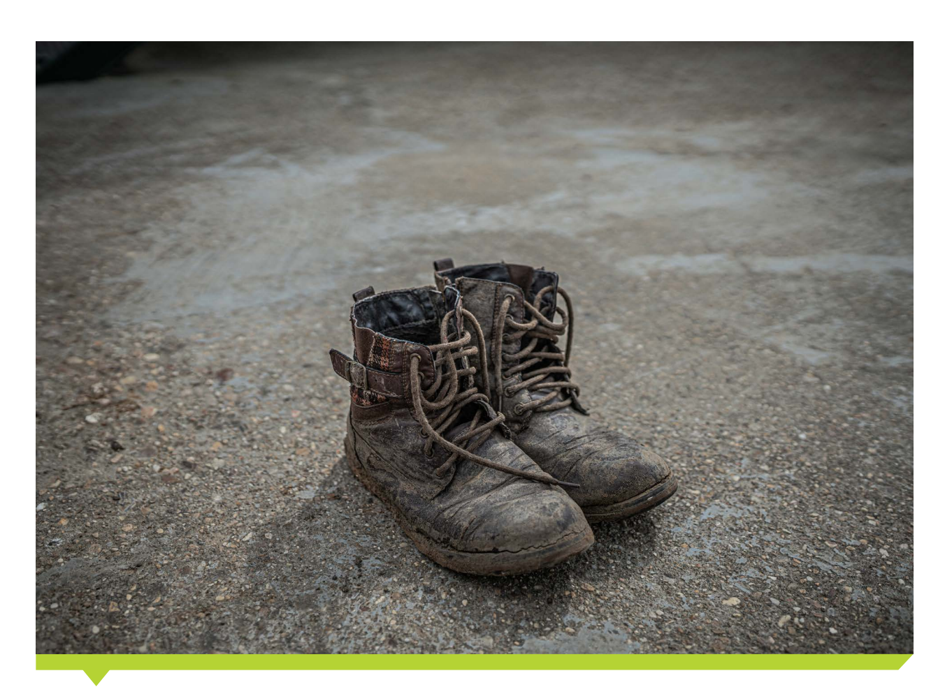
A migrant seasonal farmworker's work boots.

Very long working days have also been documented:<sup>94</sup> up to 10,<sup>95</sup>12,<sup>96</sup> 14<sup>97</sup> or even over 15-hour days.<sup>98</sup> Thai wild berry pickers in Sweden work 12–19 hours for six days a week,