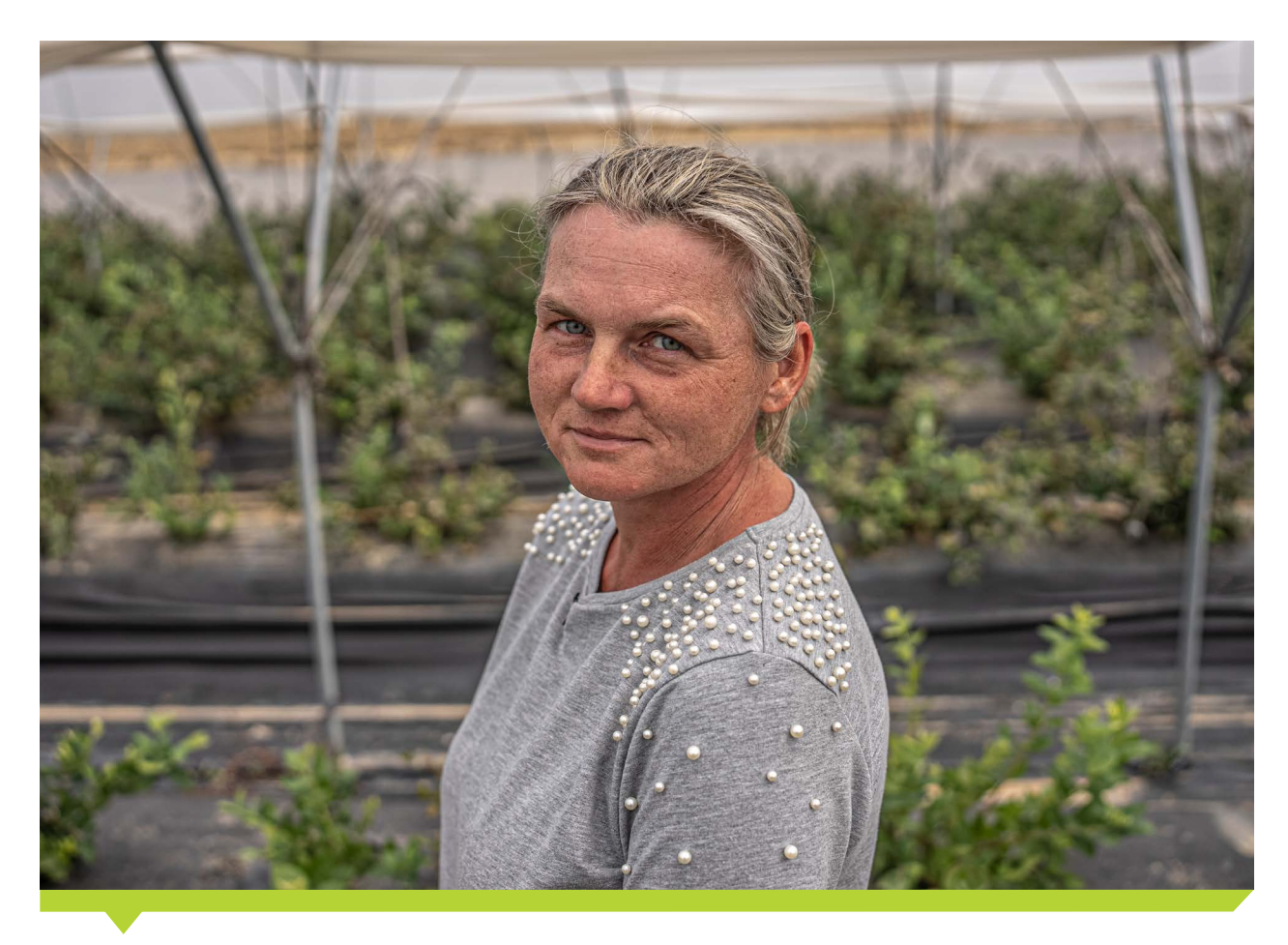
A Polish migrant farmworker on a blueberry farm.