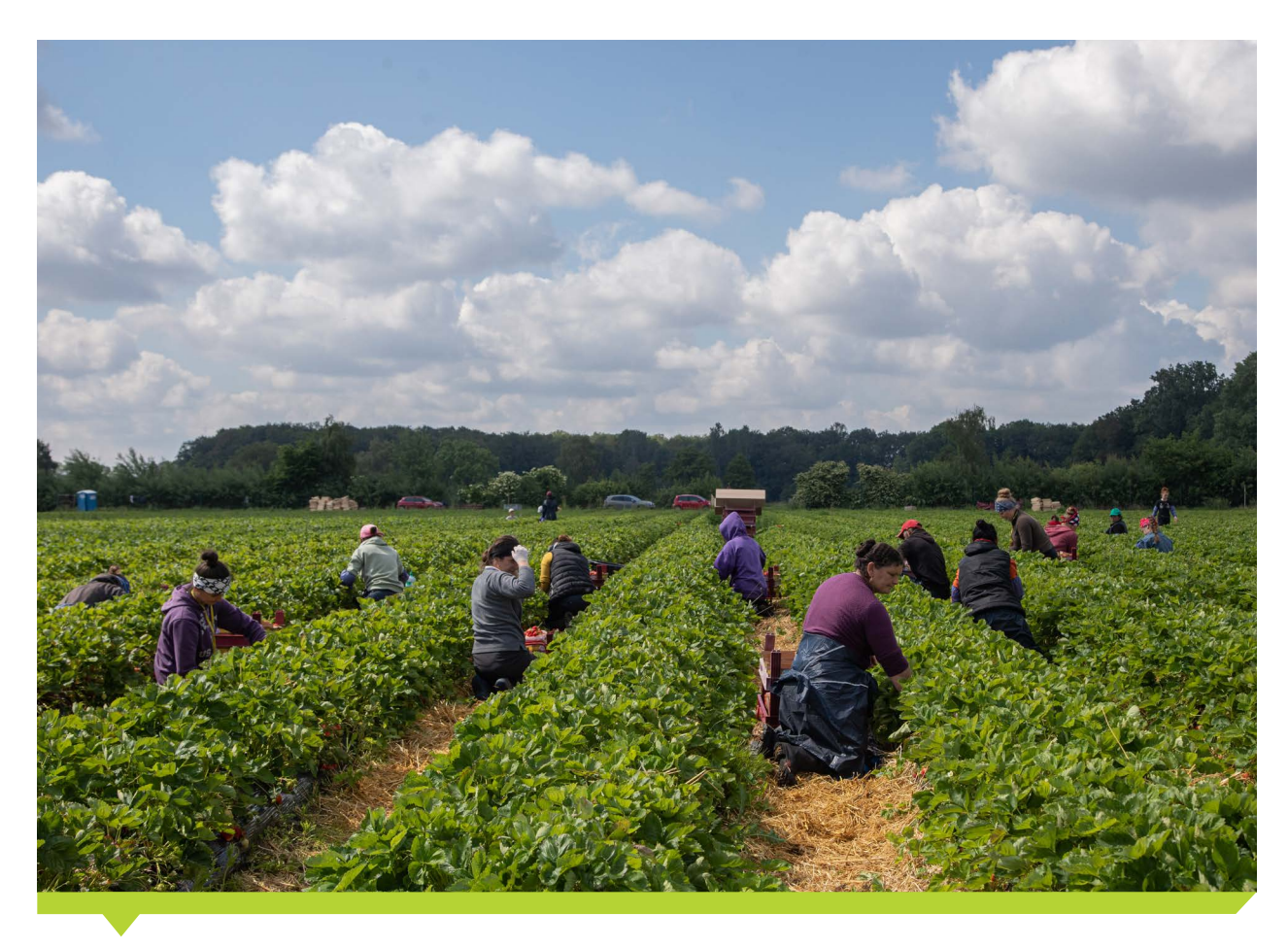
Seasonal workers on a strawberry farm in Germany.

That type of reaction by employers is clearly exceptional in the reviewed literature; it appears to be much more frequent that they respond with more subtle strategies. In some cases, workers of a certain national origin organize and achieve improvements, but in the medium term, their employers respond by replacing them with a new, more vulnerable and/or less demanding migrant group. 223 As mentioned in Section 3.2.2 , when through collective agreement, migrants were able to win better conditions, employers retaliated by charging for transportation. This is reported to have had the knock-on effect of causing migrant farmworkers to develop a more suspicious attitude towards unions. 224