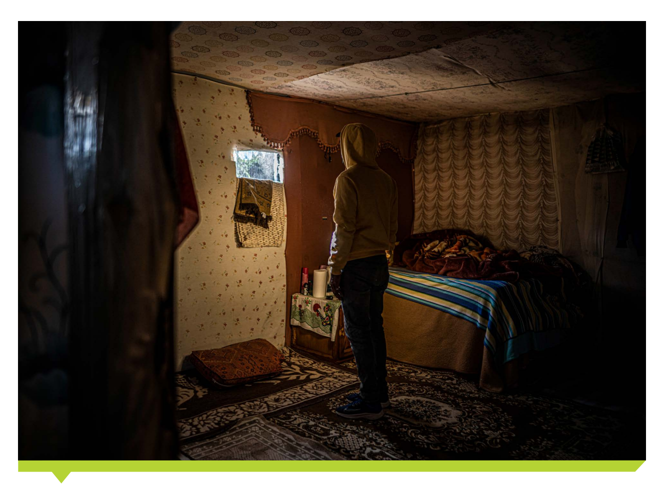
A migrant farmworker looking through the only light entry point of his shack.

Again, in Italy, the caporali (see Section 2.4.4 ) sometimes provide accommodation for their workers as additional leverage to extract income and increase their