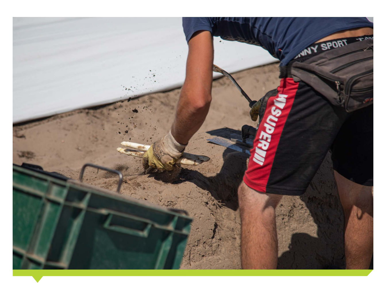
Harvesting asparagus is hard physical labour.

As a striking example, there was a case documented in hops fields in Bavaria, Germany, during the peak of the pandemic, where employers paid German workers 11-13€ per hour for the same tasks for which Eastern European seasonal workers were paid at most 10€, often less. 67 Similarly, in the Netherlands, migrant agricultural workers are paid approximately 10€ per hour, half of what non-migrant employees earn. 68