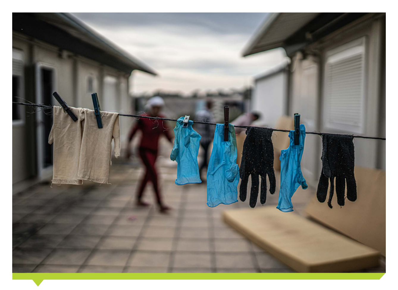
Work gloves hanging on a washing line in migrant farmworker accommodation.

In Finland, Sweden, France and the Netherlands, migrant agricultural workers are formally guaranteed access to the national health services. However, those employed as 'posted workers' (see Section 2.1.2 ), such as the Thai wild berry pickers in the Nordic countries or Central and Eastern European migrants in France and the Netherlands, pay social insurance contributions in their countries of origin, and thus not only receive lower salaries, but also lose access to healthcare, because they are not listed as tax-payers in the countries in which they work.<sup>302</sup> To avoid dealing with a workforce without health coverage, some employers enrol their workers in private health services, the cost of which they deduct directly from their wages.<sup>303</sup>