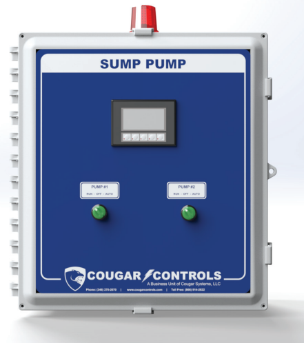
Elite Series Duplex 1ph