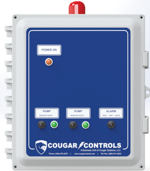
Spartan Oil Logic Series