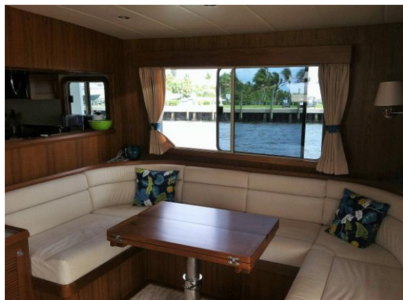
Large U-Shape Settee to Starboard