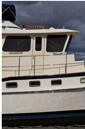
Exterior of Pilothouse