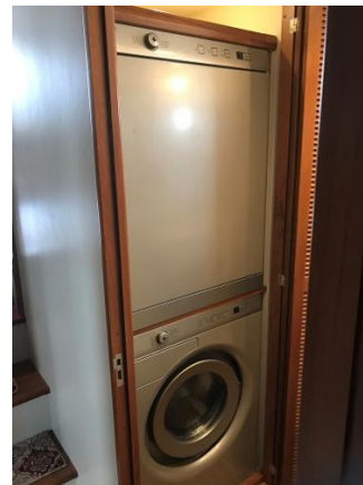
Washer AND Dryer!