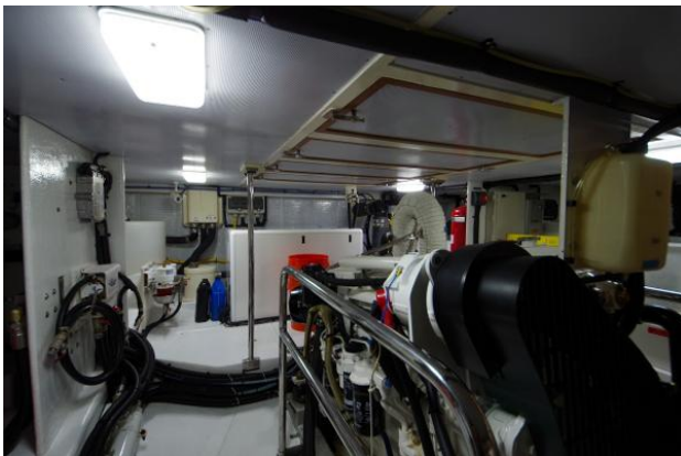
Starboard Side of Engine Room