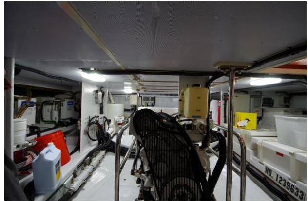
Center of Engine Room