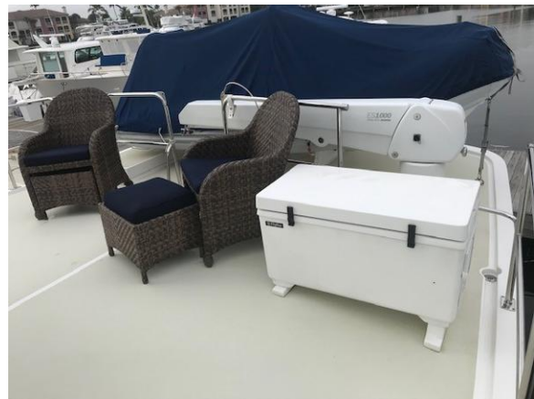
Tender, Crane, Freezer and Seating on Boat Deck