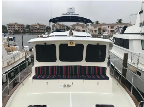
Foredeck Looking Aft