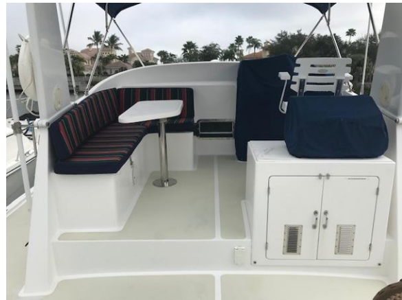
Flybridge with Settee, Helm, Grill and Refrigerator