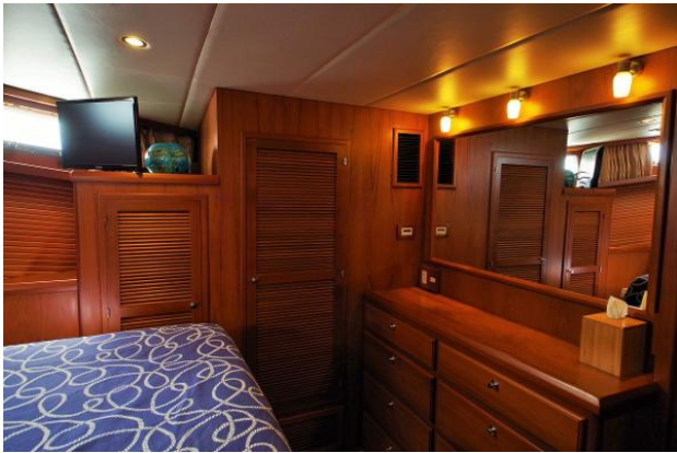
Master Closets and Bureau