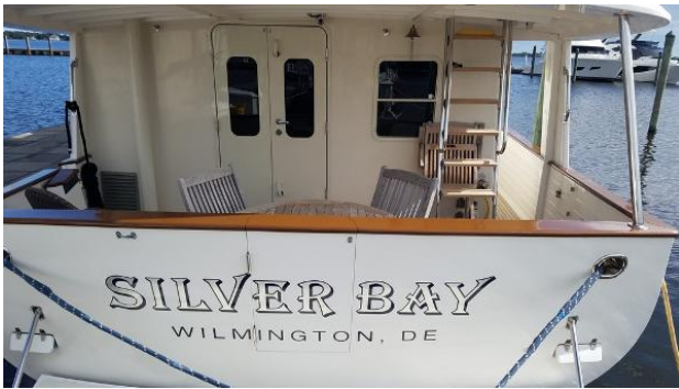
Fully Covered Aft Deck