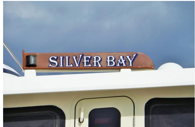
Custom Name Board