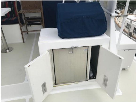
Refrigerator on Flybridge