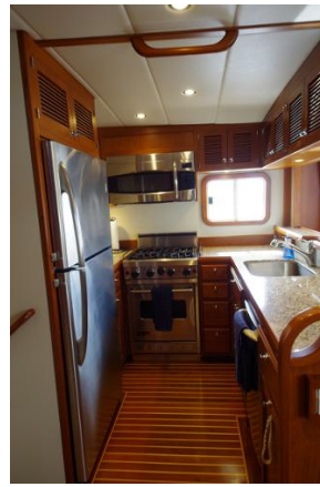
Galley with Household Appliances