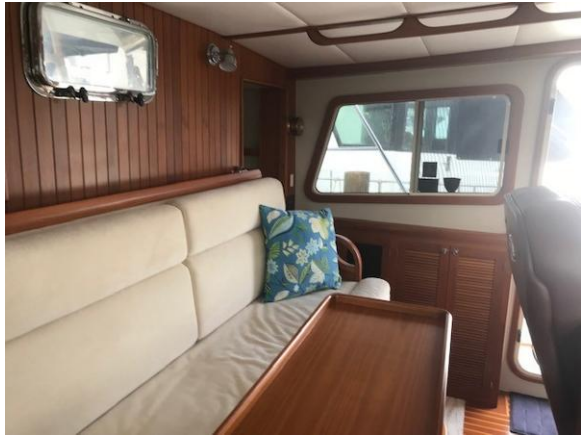
Settee/Pilot Berth Behind Helm