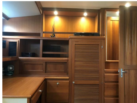
Desk and Storage in Guest