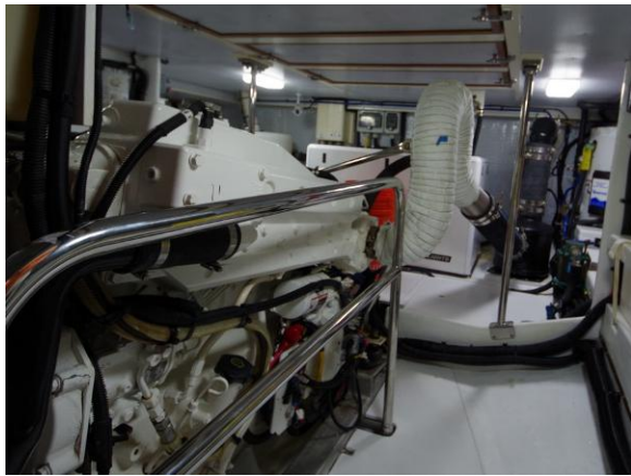
Port Side of Engine Room