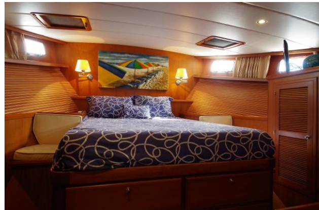
Queen Master Berth with Drawers Under