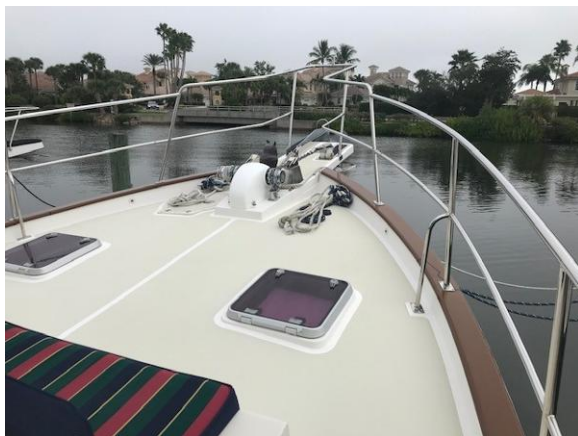
Clean and Functional Foredeck