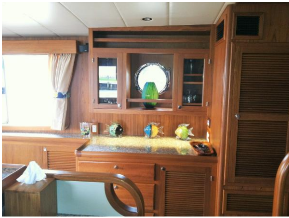
Bar and Buffet Area to Port