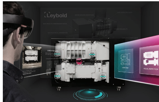
HoloLens integration for Leybold