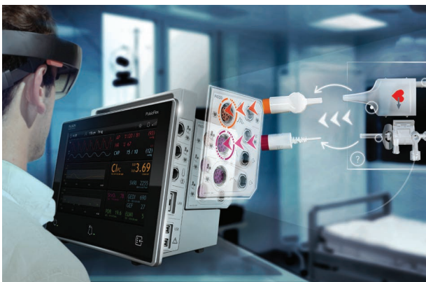
HoloLens Integration for Getinge