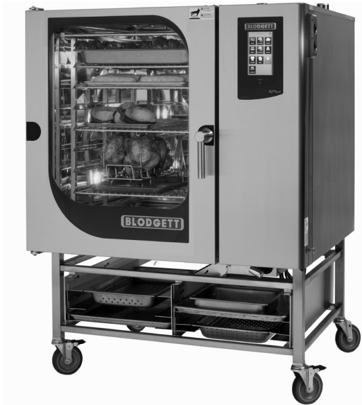
Shown on optional stand with casters