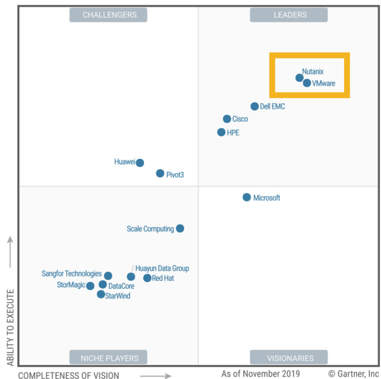
Gartner Magic Quadrant for HCI, 2019