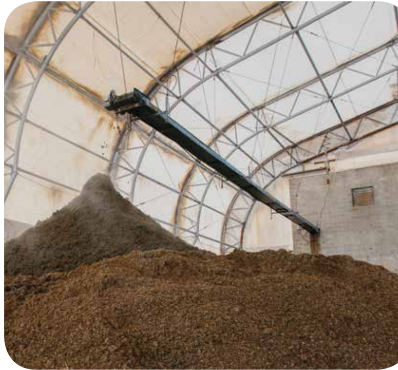
Dairymen have begun to incorporate decanter centrifuges into their manure management processes based on the advantages they deliver to separate manure solids.

Every dairy operation has a different configuration. However, a decanter centrifuge can be readily incorporated into