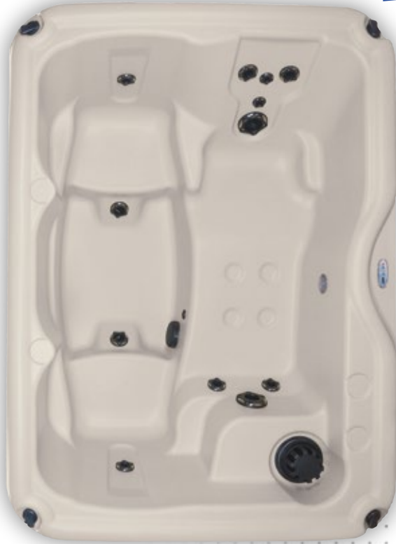
Shown in French Vanilla