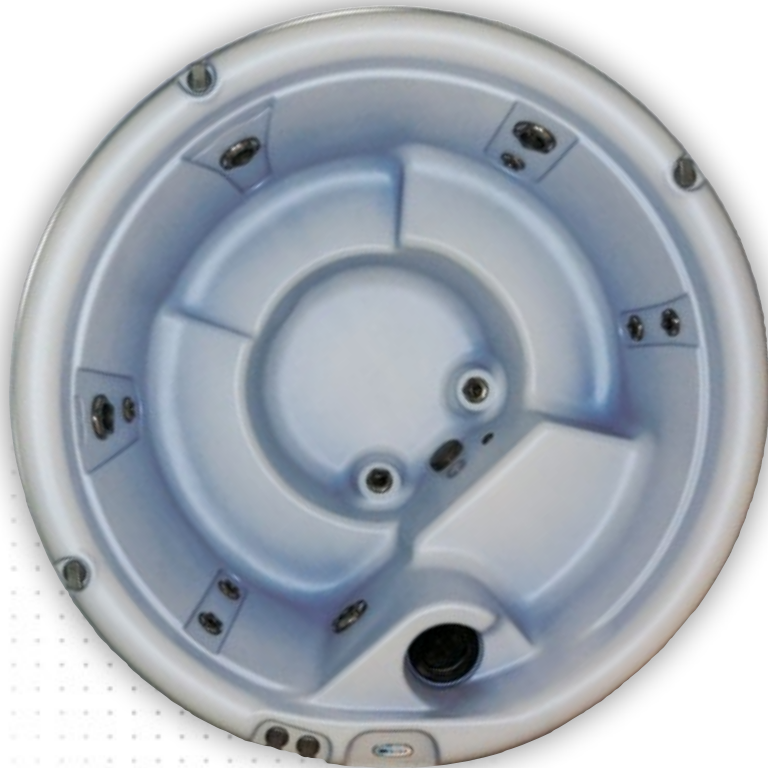
Shown in Glacier White