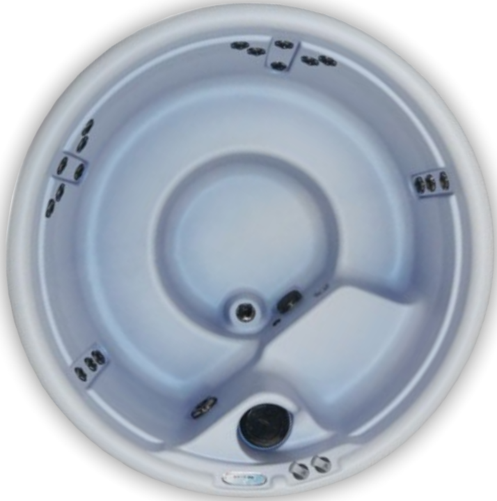
Shown in Glacier White