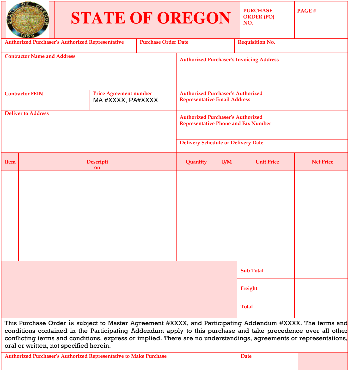
EXHIBIT NO. 4 SAMPLE PURCHASE ORDER