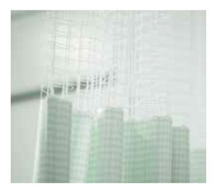
Sanitizes soft surfaces in 20 seconds.

Rapid kill and dry times mean that by the time the product dries, the germs have been killed, making it possible to turn over a room more quickly. PURELL Healthcare Surface Disinfectant is effective on most hard and soft surfaces, including: