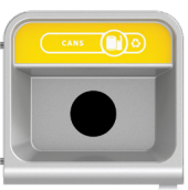
CANS / BOTTLES