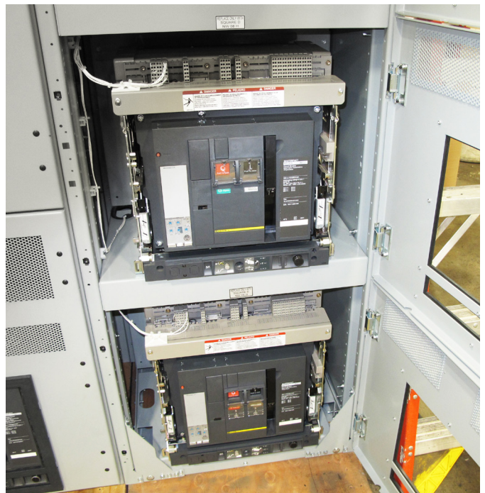
Figure 2: Each draw-out breaker is compartmentalized by grounded barriers.