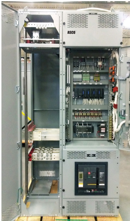
Figure 3: Front-connected UL 891 PCS equipment.