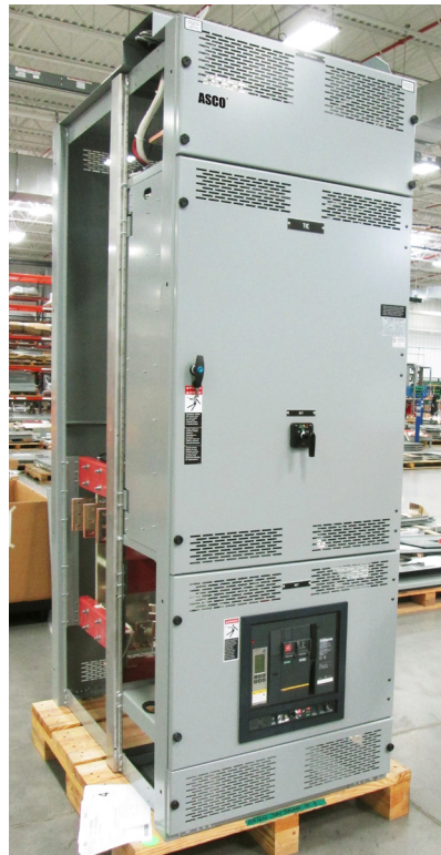
Figure 4: UL 891 Distribution Equipment - If this were UL 1558 equipment, panels would separate the front of the enclosure from the rear, and side panels would enclose the left side.