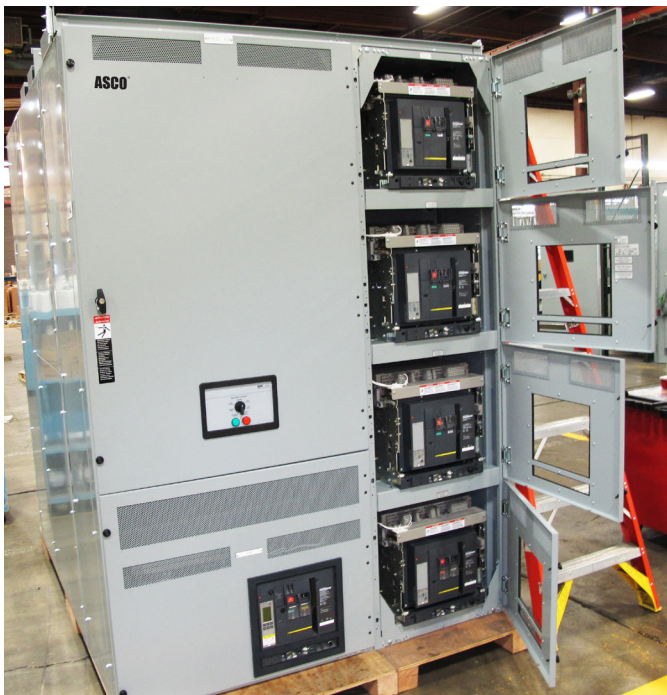
Figure 1: ASCO UL 1558 PCS equipment with UL 1066 circuit breakers.

UL 891 – Switchboards defines safety tests for power control equipment serving circuits operating at nominal ac voltages of not more than 600 volts. UL 891 testing is referenced throughout NEMA PB 2 - Deadfront Distribution Switchboards , the design document from which UL 891 was developed. Compartmentalized construction is not required by UL 891. In practice, some major PCS manufacturers incorporate UL 1558 compartmentalization into their equipment regardless of whether UL 891 or UL 1558 ratings are required for an application.