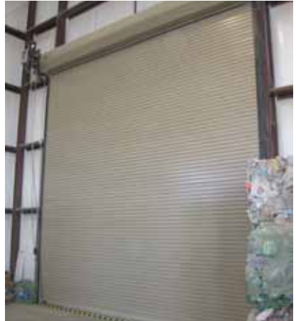
Janus rolling steel doors installed at Brazos Valley Recycling Center in Houston, TX