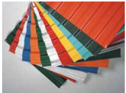
Recyclable paint coverings minimize hazardous conditions