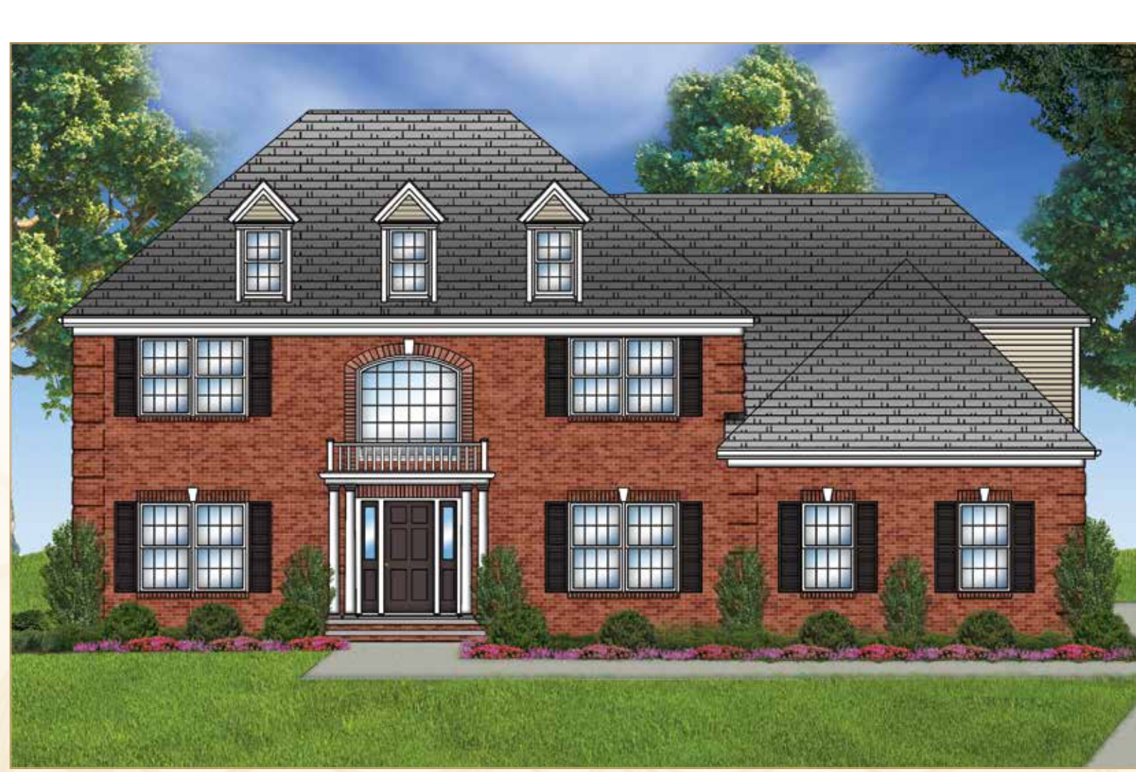
CLASSIC CARNEY V