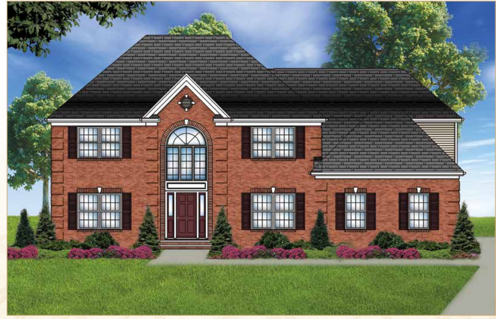
CLASSIC CARNEY IV