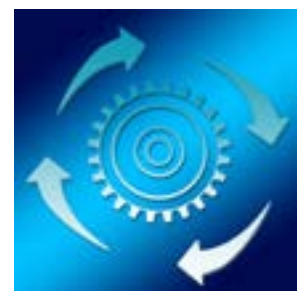
FOTO initiated the risk adjusting process into its system in 2003. By risk-adjusting, FOTO is able to compare your patients to analogous episodes internationally. FOTO provides risk-adjusted:

FOTO is committed to providing the most accurate benchmarked comparisons available in today's sophisticated healthcare arena. Accurate comparisons take patient differences into account and risk adjustment plays a key role in FOTO's ability to do this.