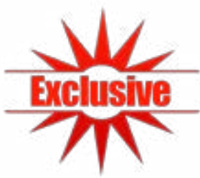
FOTO is exceptional at what it does. FOTO offers exclusive patient reported outcome measures. The FOTO web based system focuses on computer adaptive testing methodology. The FOTO solution is unique in its risk adjustment and predictive capabilities. At FOTO we have a proprietary system and measurement tools. FOTO prides itself in being leading edge, ever-evolving and forward thinking. We believe our solution is superior to the suboptimal, publicly available options for measuring rehabilitation outcomes. FOTO sets and maintains high standards: strong, research supported methodology.