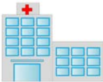
FOTO designed its measures and system to be focused on measuring function and capturing functional change. Because the focus is functional status change with risk adjustment and predictive analytics built into the solution, the FOTO system can be used on many types of patients . The practice settings in which FOTO can be used include outpatient rehabilitation, chiropractic, occupational health, adult day care, workers compensation and surgeon offices.