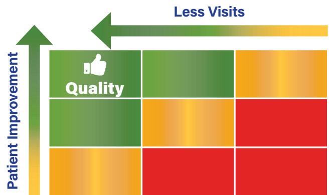
FOTO Pay for Performance Model

Baton Rouge Physical Therapy – Lake was able to meet all three Quality Blue PT/OT requirements to receive higher payment for services: quality, satisfaction and completion rate criteria. Because FOTO includes a completion rate gauge in its system, Baton Rouge Physical Therapy – Lake was able to easily meet completion rate criteria. Baton Rouge Physical Therapy – Lake achieved more than a 33.33% increase in its completion rate. Careful monitoring and focusing on assessment processes allowed Baton Rouge Physical Therapy - Lake to surpass the completion rate requirement.