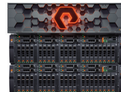
FIGURE 2: FlashArray//C60 capacity scaling