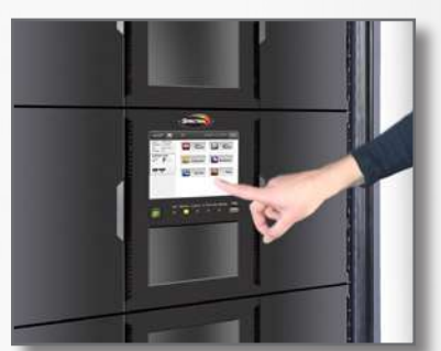
Convenient front panel color touchscreen

Easy to use and manage, the library's management software provides a similar feature set as the rest of the Spectra tape library family, including an intuitive color touchscreen, remote web interface, ability to create partitions (up to 20), built-in diagnostics, Media Lifecycle Management, Drive Lifecycle Management, encryption, and encryption key management. An optional SpectraVision web camera can be mounted inside the rack to provide an immediate visual assessment of all robotics.