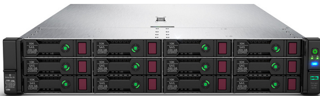
FIGURE 6-2: The HPE ProLiant DL380 Gen10.

HPE's all-time best-selling server is the ProLiant DL380, currently in its tenth generation (see Figure 6-2). Although it's usable primarily for small-scale AI deployments, the DL380 can support NVIDIA GPUs for AI training, and you can add multiple servers to a cluster as you need to expand your machine learning capabilities.