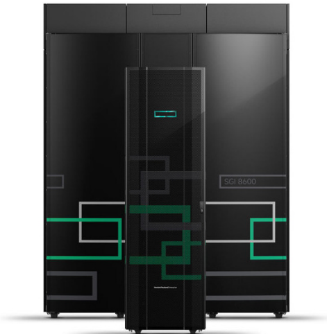
FIGURE 6-5: The HPE SGI 8600.

For petaflop-scale deep learning, HPE introduced the HPE SGI 8600 (see Figure 6-5). This liquid-cooled platform delivers leading performance, density, and efficiency and is used for extremely large training exercises. There are three compute trays, with the HPE XA780i Gen10 Server as the ideal deep learning platform used to monitor and observe data processing for pattern recognition and anomaly detection. This tray features a two-central processing unit (CPU) socket node with the Intel Xeon Scalable processors with support for up to four NVIDIA Tesla graphics processing units (GPUs) with NVLink.