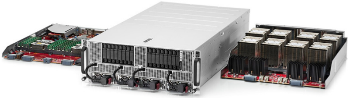
FIGURE 6-4: The HPE Apollo 6500 Gen10.