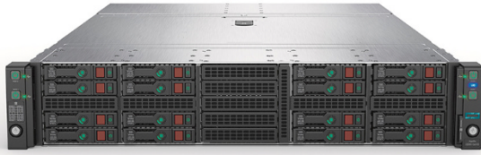
FIGURE 6-3: The HPE Apollo 2000 Gen10 Chassis.

Offering a flexible configuration, the HPE Apollo 2000 Gen10 system supports a variety of workloads, from remote site systems to large AI-centric HPC clusters to everything in between. You can deploy the HPE Apollo 2000 Gen10 cost-effectively, starting small with a single 2U shared infrastructure and scaling out up to 80 HPE ProLiant Gen10 servers in a 42U rack.