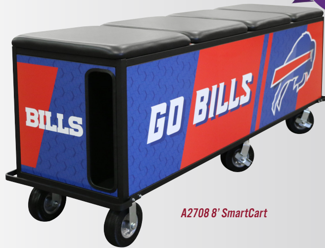
A2708 8' SmartCart

The SmartCart™ is durable, functional and convenient. With its heavy-duty 1 1/4" tube steel frame, panel steel construction and ample storage, this product is sure to meet all your mobile taping, evaluation and/or treatment needs. Athletic Edge's SmartCarts are offered in many sizes to meet your game day and practice needs. Features include various cabinet and shelf configurations, large pass through storage areas, 360° rotating heavy duty locking wheels, a pull handle and 1-1/4" receiver hitch for ease of mobility. Graphics package includes custom graphics on all 4 sides of the cart.