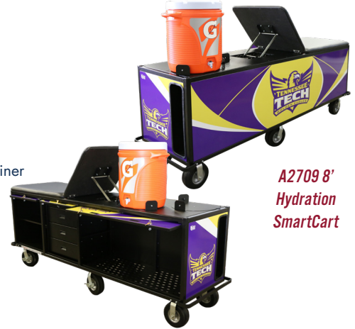
A2709 8' Hydration SmartCart