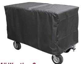
All Weather Cover