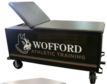
A2706-PRO 6' PRO SmartCart with Deboss Logo