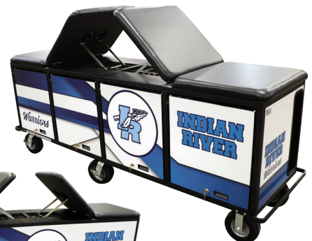
A2708 8' SmartCart