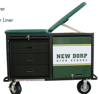
A2704 4' SmartCart