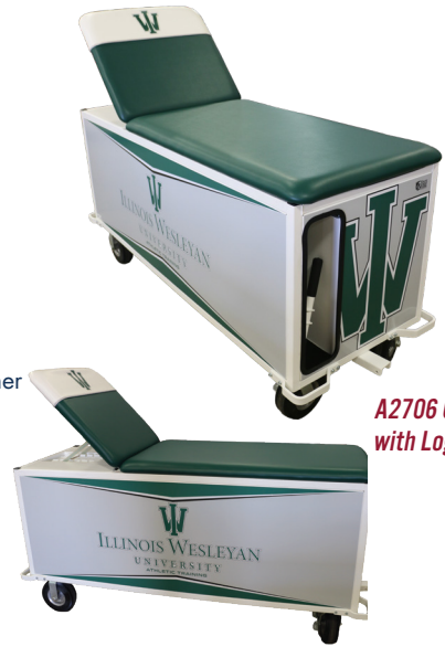
A2706 6' SmartCart with Logo Slip Cover