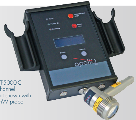
AP2-DT-5000-C 2-channel desktop unit shown with 5000mW probe

Built for the busy office and clinic, our two-channel Apollo Desktop Laser Unit offers both convenience and power: With two probes, clinicians can work on two patients at the same time or two areas on the same patient. You can also customize your unit with a variety of powerful probes for deep tissue or more delicate treatment. This desktop unit features a user-friendly LCD display with probe status and treatment times (ranging from 10 seconds to 2 minutes), built-in safety and fault detection software and a built-in power test to assess probe output.