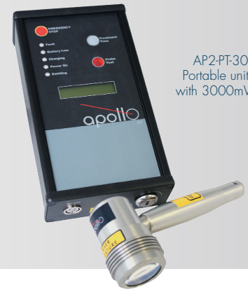
AP2-PT-3000-C Portable unit shown with 3000mW probe

Move easily from room to room or out in the field with the Apollo Portable Laser Unit. Designed for use by chiropractors, physical therapists, physicians, dentists and veterinarians, our portable unit weighs only 2.3 pounds but delivers powerful results: With a single overnight charge, you can perform up to 60 to 70 treatments. This portable unit also features a user-friendly LCD display with probe status and treatment times (ranging from 10 seconds to 2 minutes), built-in safety and fault detection software and a built-in power test to assess probe output.