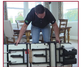
Adjustable Height Folding Legs