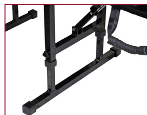
Height Range: 18.5-22.4"