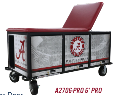
A2706-PRO 6' PRO SmartCart