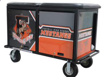
A2704 4' SmartCart