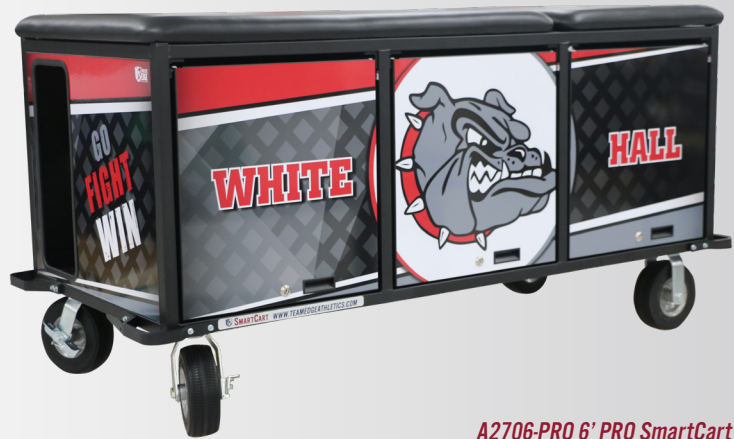
A2706-PRO 6' PRO SmartCart

The SmartCart™ is durable, functional and convenient. With its heavy-duty 1.25" tube steel frame, panel steel construction and ample storage, this product is sure to meet all your mobile taping, evaluation and/or treatment needs. Athletic Edge's SmartCarts are offered in many sizes to meet your game day and practice needs. Features include various cabinet and shelf configurations, large pass through storage areas, 360° rotating heavy duty locking wheels, a pull handle and 1.25" receiver hitch for ease of mobility. Graphics package includes custom graphics on all 4 sides of the cart.