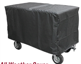
All Weather Cover