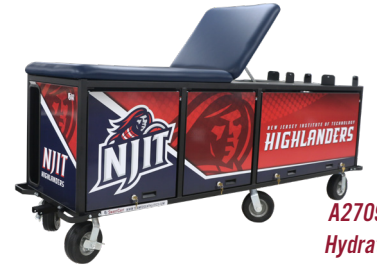
A2709 8' Hydration SmartCart