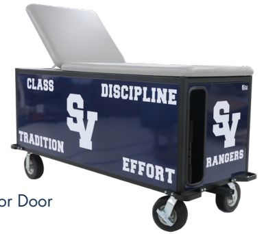
A2706 6' SmartCart