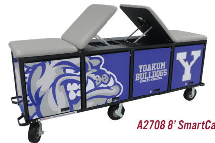
A2708 8' SmartCart