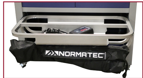
Slide Out Boot Rack (NormaTec Recovery System Not Included)