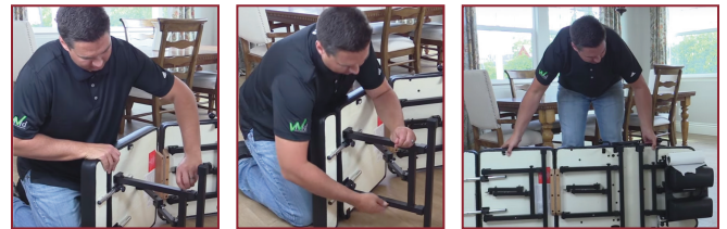
Adjustable Height Folding Legs