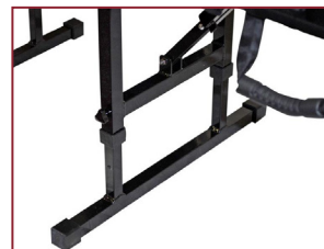
Height Range: 18.5"-22.4"