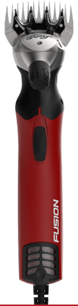
LISTER FUSION SHEAR