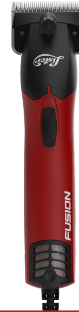
LISTER FUSION CLIPPER