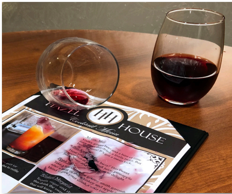
Menu on paper

REVLAR synthetic paper is the perfect solution for restaurants who are looking to upgrade their menu aesthetics. Through REVLAR menus, you can offer your customers a more pleasant dining experience.