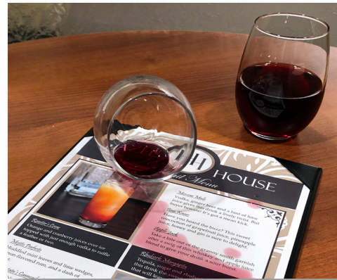
Menu on REVLAR