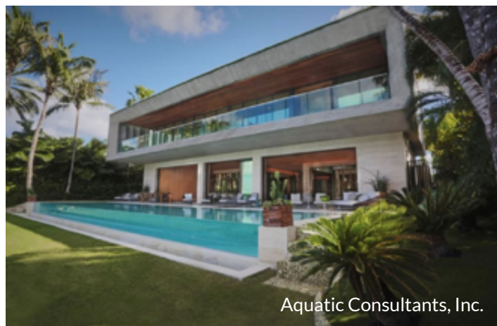
Aquatic Consultants, Inc.

views beyond your pool don't have to be exotic to warrant an acrylic glass side. Just as many pool owners enjoy views of their own gardens and property with this revealing effect. Plus, the acrylic side adds a sleek effect to the pool that's stunning and makes a big impression on guests.