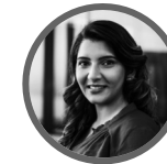
Settlement (Title / Escrow)