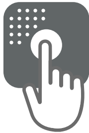
Convenient for resident to access