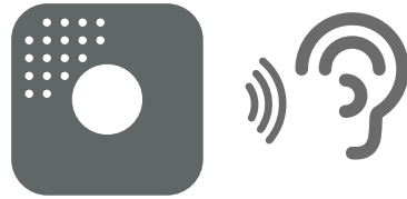
Where speakerphone can be heard throughout premises