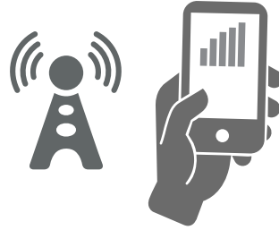
Good cellular reception (Cellular version only)