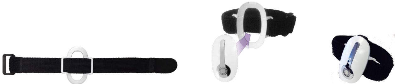
Figure 3 – EP on a Wristband

To wear the EP on your wrist, attach the EP to the clip-on base attached to the supplied wristband, as illustrated in Figure 3 below.