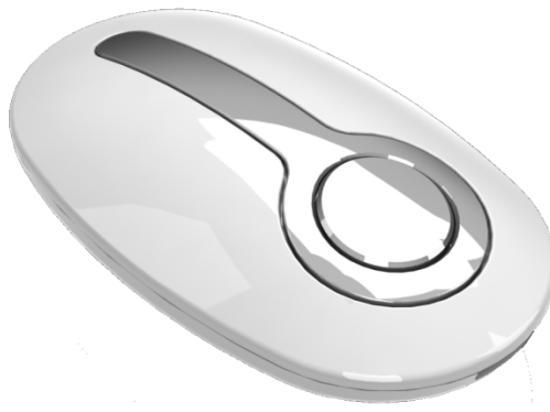
Figure 1 – Essence Emergency Pendant

The EP peripheral device model identification number is ES700EP.