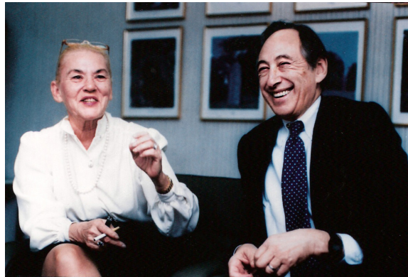
Alvin Toffler 1928-2016

“They [the Tofflers] set the standard by which all subsequent futurists have been measured.”