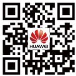
Huawei Enterprise APP

To learn more about Huawei storage, please contact the local office or visit Huawei Enterprise website http://e.huawei.com .