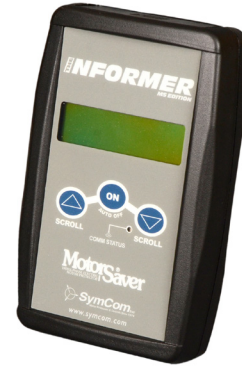
Figure 3. Littelfuse Informer-MS

“The Informer is an invaluable tool for us to help figure out what problems are occurring and provide a solution to our customers. It’s a good tool to go back and get history on peaks and low voltages,” says Blair. It saves us time and frustration and gets the water flowing again quicker, which makes the customer happy.” Blair’s parting comment to all of his customers is, “Having a PumpSaver® on your pump is like having a pump man watching your pump 24 hours a day, 7 days a week.”