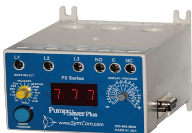
Figure 1. The 777 KW/HP-P2

The 233P model protects pumps from 1/3-3 Hp, while the model 235P is for 230V 5-15 Hp pumps. Both models can be mounted in a separate pump control panel or pre-mounted in