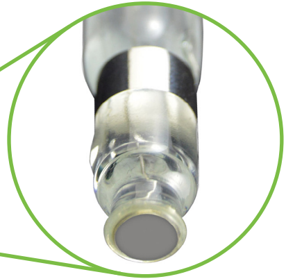
Innodisk® Sensor Technology