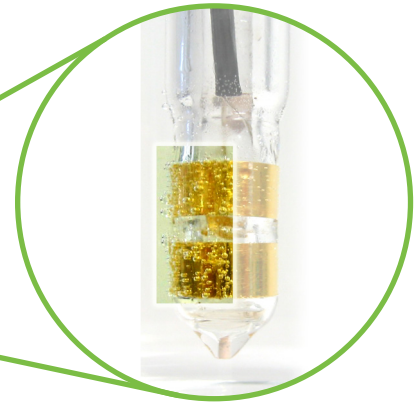
ASR® - Automatic Sensor Cleaning