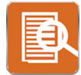
Network Traffic Analysis