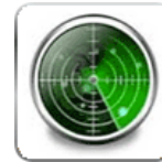
PCI ASV External Scans