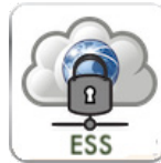
Enhanced Security Service