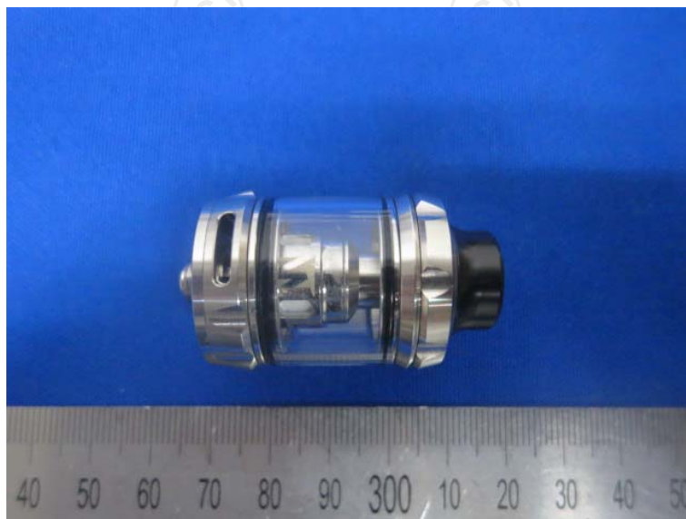
Flow Pro Subtank