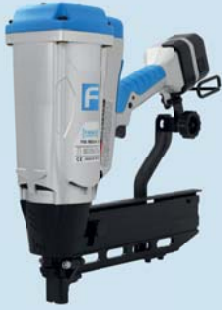
F70G FENCE 40-315