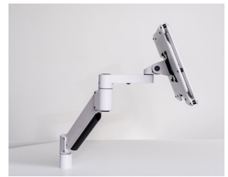
[ Desk Mount ]