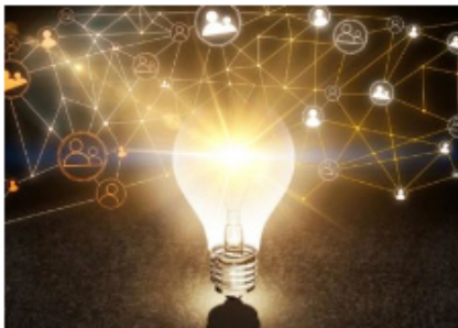
eBook: Embracing HR Innovation